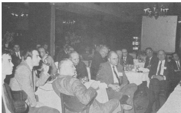
General view of the audience at Whyte's Restaurant.